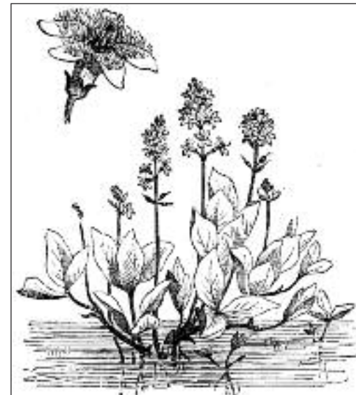
The feathery, star-like flowers of the bog-bean are pink on the outside and white on the inside.