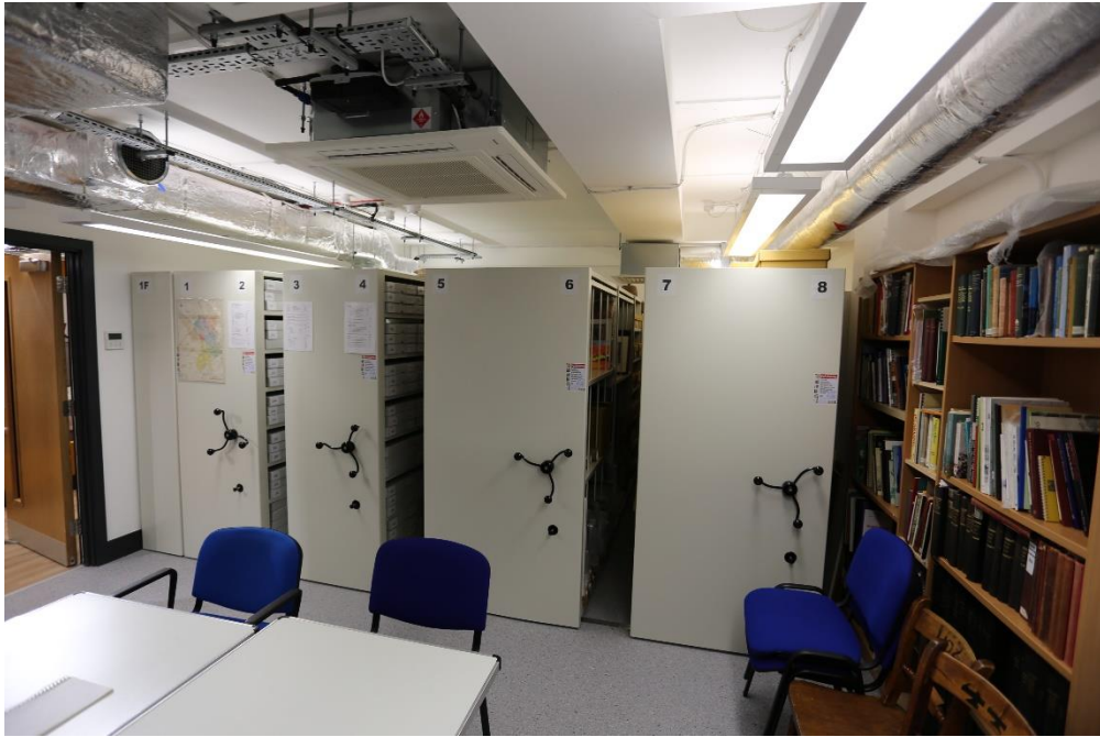
Les Casey Archive – February 2024