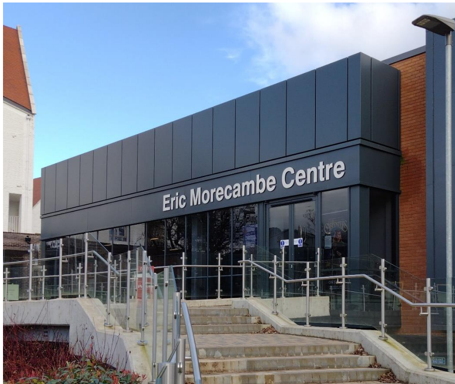
Eric Morecambe Centre, converted from previous Sports Hall and replacing the Public Halls. Opened October 2021.